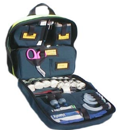
Fig 3: First Aid Backpack