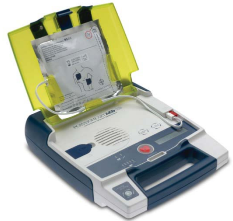
Fig 5: Cardiac Science, Powerheart AED G3

By having a defibrillator at your premises, trained first aiders can deliver this life saving shock to the patient in sudden cardiac arrest almost immediately. Statistics clearly show that where a person receives this life saving electric shock within 5 minutes of collapsing their survival rate increases to over 70%.