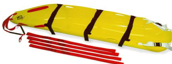
Fig 4: Sked Stretcher